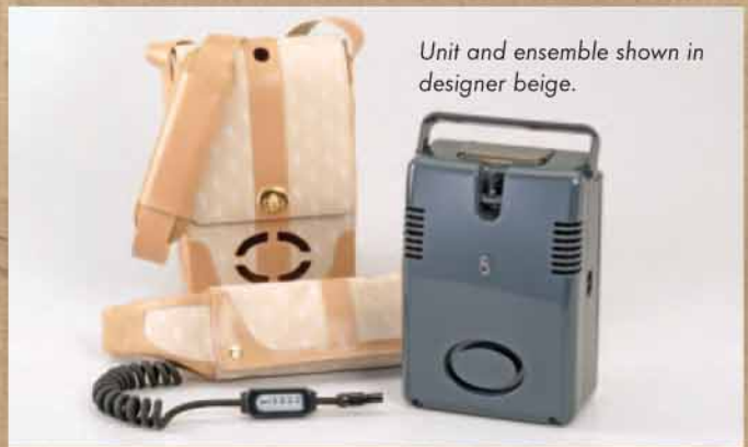
Unit and ensemble shown in designer beige.