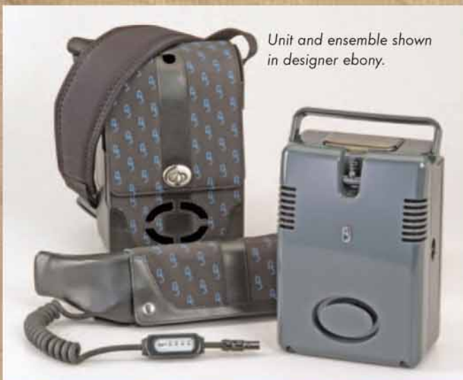
Unit and ensemble shown in designer ebony.

With FreeStyle at your patient's side, what was once improbable, or even impossible, is now a day-to-day reality. If your patient can do it, FreeStyle will be right there as a steady, lightweight, and long-lasting, stylish companion.