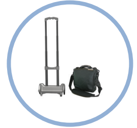
Inogen One ® G2 Cart & Carry Bag* Item # CA200