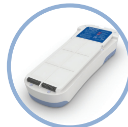
Inogen One ® G2 24-Cell Lithium Ion Battery** Item #BA224