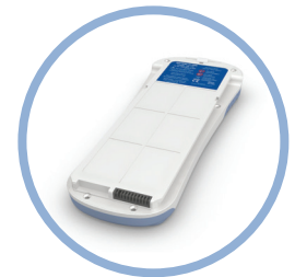
Inogen One ® G2 12-Cell Lithium Ion Battery* Item #BA200